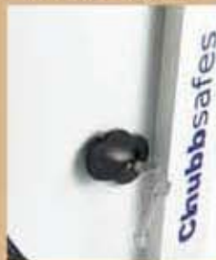
a) 8-lever double bitted Key Lock only, certification under UL 437. Furniture Projection: 27mm