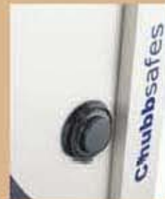
b) 3-wheel Keyless Combination Lock only, listed under UL Group 2. Furniture Projection: 30mm