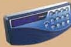
Electronic Lock Furniture Projection: 30mm