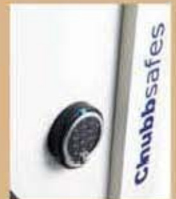
c) 203 Digital Combination Lock, listed under UL Type 1. ( Power Source 1 unit of 9V size battery ) Furniture Projection: 38mm